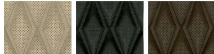
Quilted Almond Leather 4 Platinum