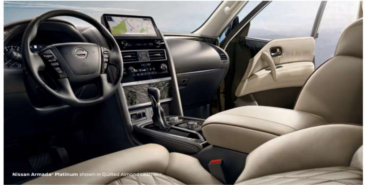
Nissan Armada ® Platinum shown in Quilted Almond Leather