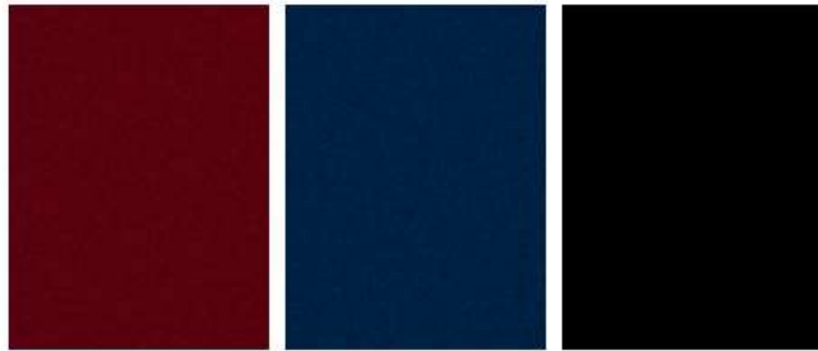
Coulis Red Pearl 3