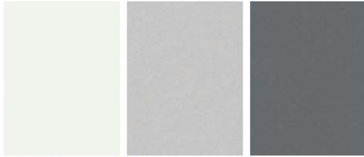
Aspen White TriCoat 3