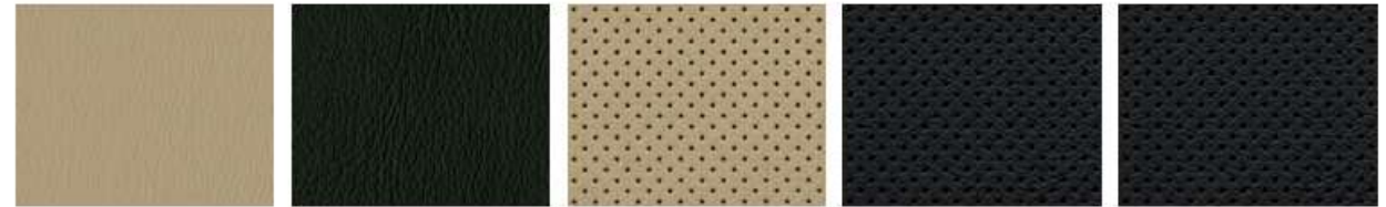
Almond Leatherette SV